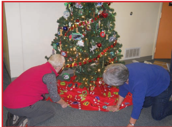
Westbrook-Warren Congregational Church, at 810 Main Street, Westbrook, Maine

We would like to organize a club visit on Friday, December 12th at 6:00pm