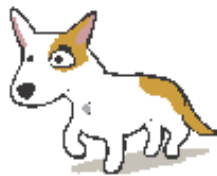
Moving in Slow Motion walking slow on floor