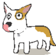
Licking Lips when no food nearby