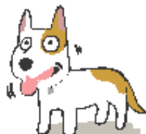
Panting when not hot or thirsty