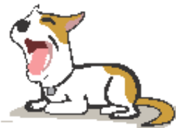
Acting Sleepy or Yawning when they shouldn't be tired