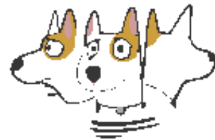
Hypervigilant looking in many directions