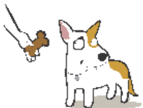
Suddenly Won't Eat but was hungry earlier