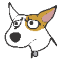
Brow Furrowed, Ears to Side