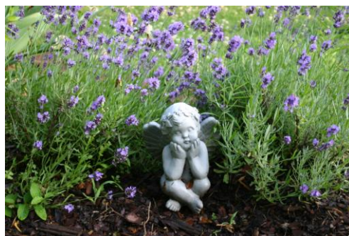
Waiting for Spring!